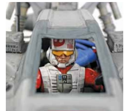
Hasbro came through again with a great Rebel Pilot. I hit him with flat clear Tamiya TS spray and a wash of black to bring out the detail.