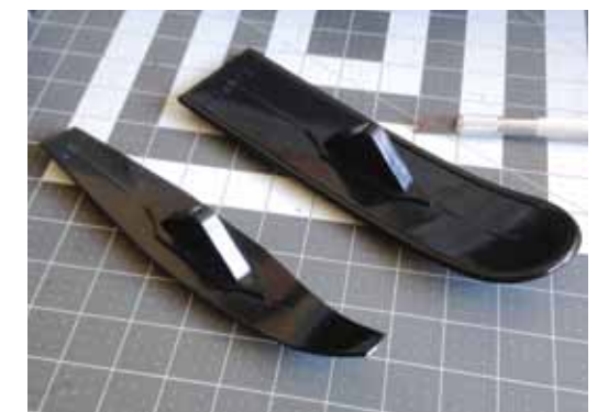
Above: The Full Force snow skis needed to be cut down to better match the proportions of the B4 body.