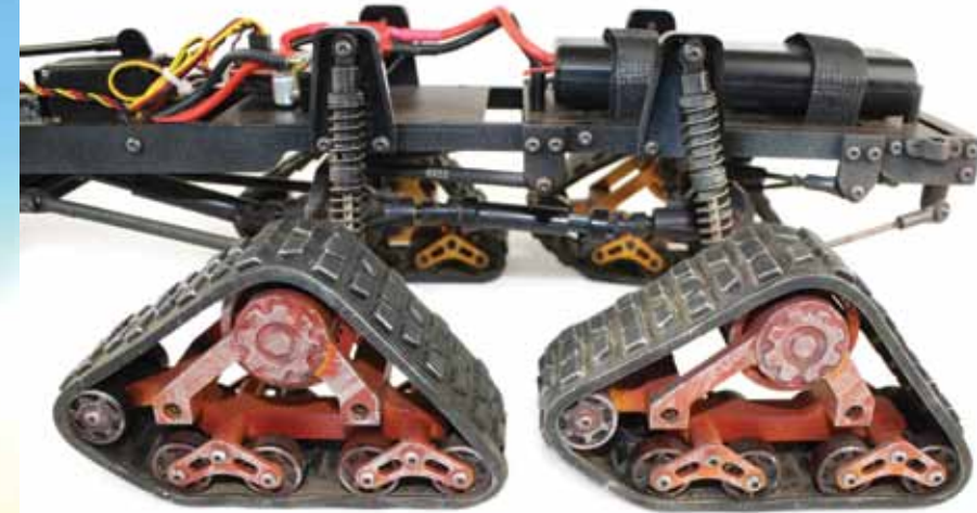
Above: Fitting the Predator tracks required only slight modification. Shortening the rear links 43mm provides enough space for both rear tracks.