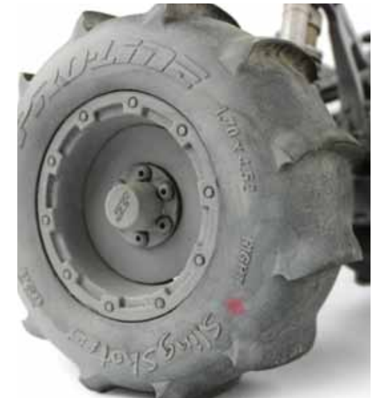
Pro-Line's Sling Shots work great on sand and snow. Tamiya grey primer gives them a weathered look.