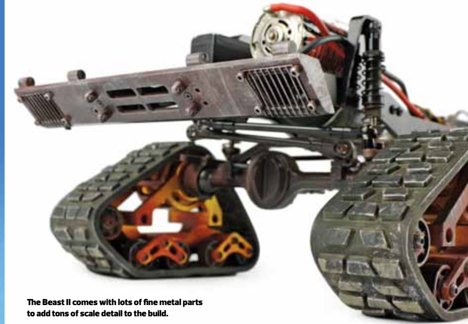
The Beast II comes with lots of fine metal parts to add tons of scale detail to the build.