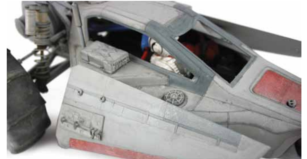
Panel lines, model kit parts, and a matte Rebel-style paint scheme transform the B4 body. With a bit of paint, Pro-Line's scale power inverter becomes extra "tech stuff" for the Snow Runner's body.