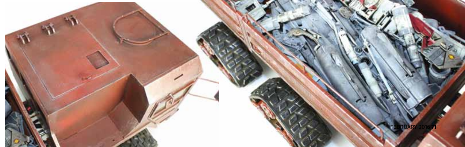
The detail RC4WD packs into the hard plastic body is amazing. Painting and weathering the hard body with Tamiya acrylic paints goes a long way to make it look more realistic.