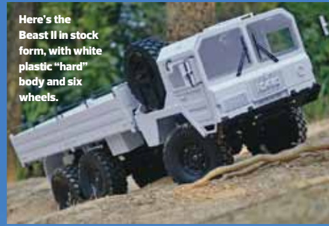
Here's the Beast II in stock form, with white plastic "hard" body and six wheels.

To make the vehicle feel more like it was owned by a trash-trading Jawa, I added some junk to the rear bed of the Beast. This was done using the leftover parts of an F-14 Tomcat model kit mixed in with two old Star Wars model kits I had collecting dust on the shelf. Everything was then given a black wash to bring out all the cool detail in the parts and give it that used and abused junkyard look.