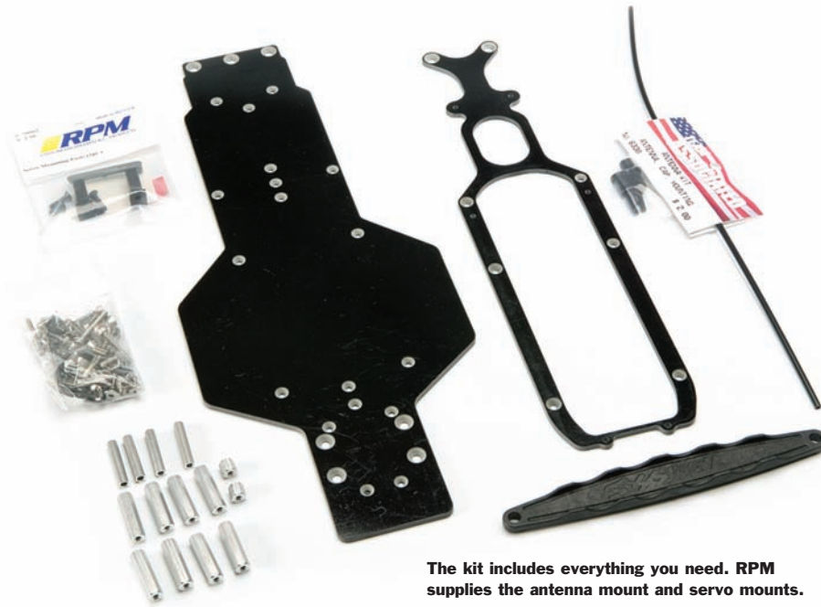
The kit includes everything you need. RPM supplies the antenna mount and servo mounts.