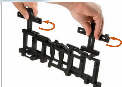
... give them a twist ...